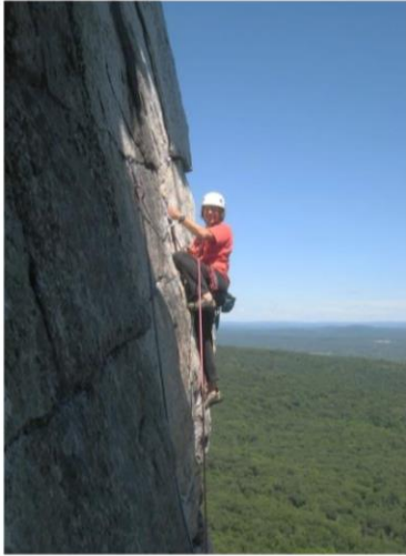
Gunks, NY - 2013