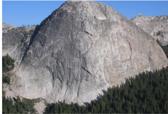
Fairview Dome, Tuolumne Meadows, CA - 2010