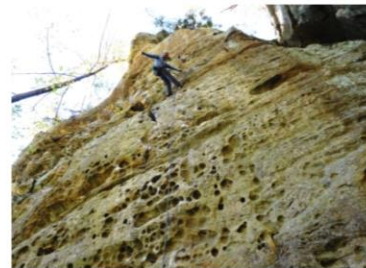
Red River Gorge, KY - 2011