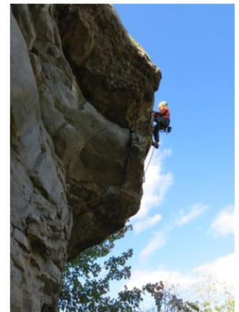
Arkansas - 2012