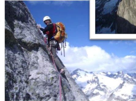
Bugaboos, BC - 2007