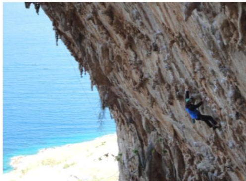
Kalymnos, Greece - 2011