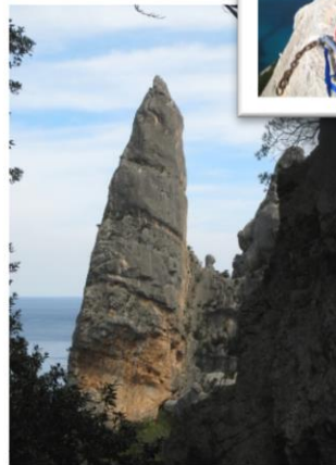
Sardinia, Italy - 2008